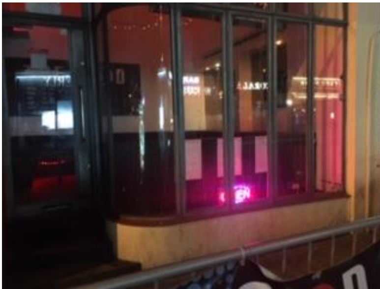
“sad, unwelcoming facade with droopy signs”