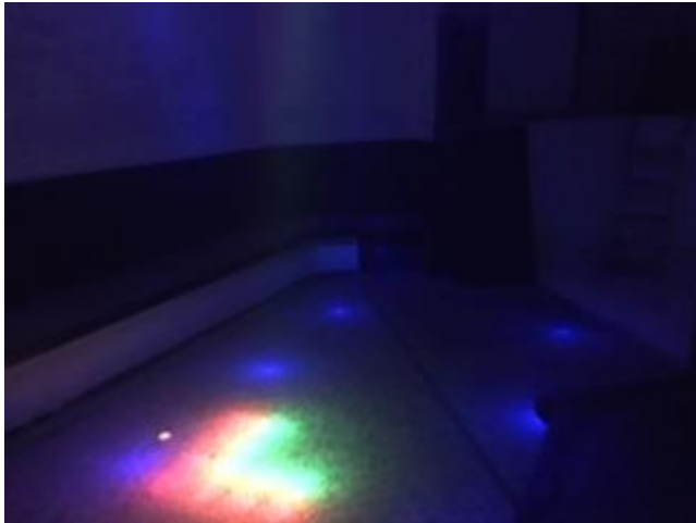
“Tiny outdated dance floor area”