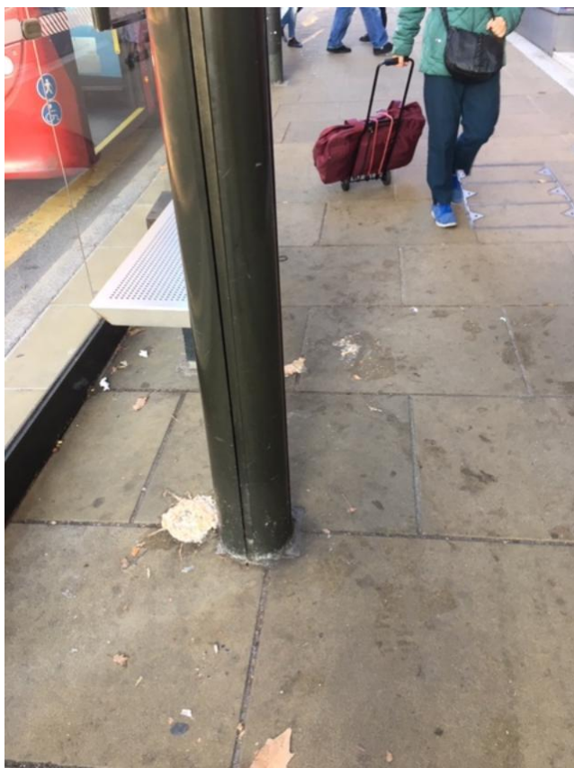
“Vomit this week at WTC bus stop”