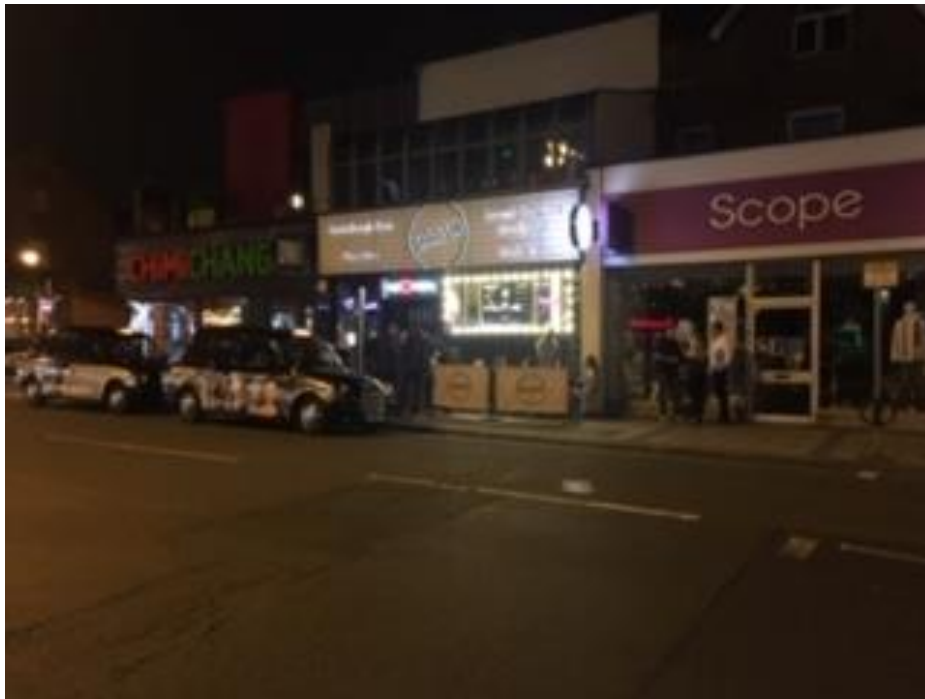
“Successful SMASH repositioning”