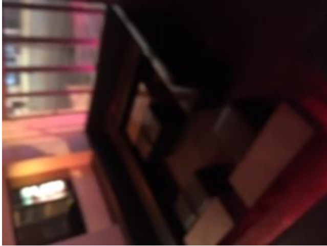
“Main entrance seating old and torn”