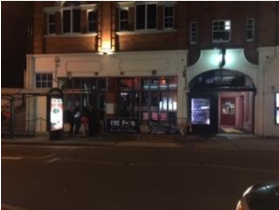
“Pod located next to Studio theatre entrance”